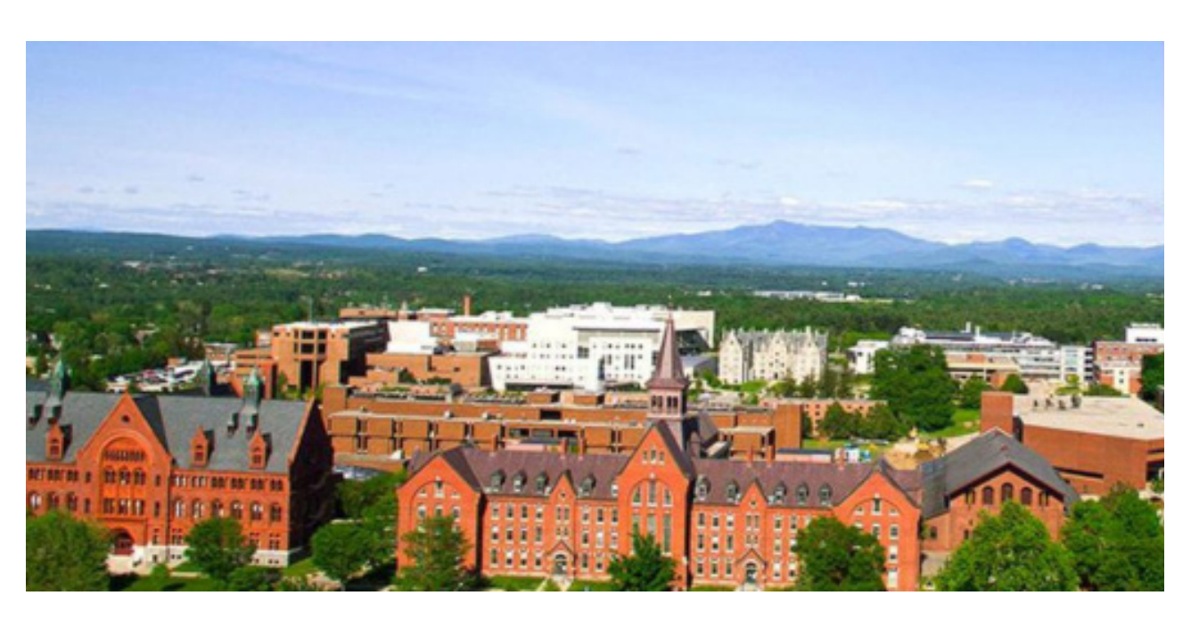
University of Vermont Campus

UVM international students are automatically enrolled in UVM's Student Health Insurance Plan to learn more visit https://www.universityhealthplans.com/letters/letter.cgi?group_id=227. Some exchange students have health insurance through their home university or through another organization. Please see J-1 Health Insurance for more information about minimum coverage requirements and how to waive enrollment in UVM's insurance. J-1 students must meet US Department of State insurance standards. Exchange students are required to provide proof of a verifiable insurance plan comparable to UVM's or will be enrolled in UVM's health insurance. ISEP's insurance plan is appropriate to be used in place of UVM student insurance.